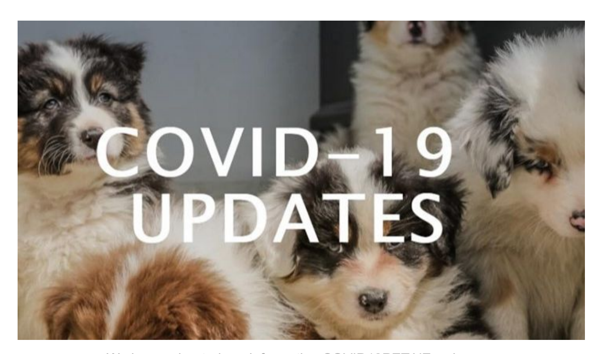
We have rebooted our informative COVID19PET.NZ web page

We are determined this conference will go ahead and will host it online over two half-days if required.